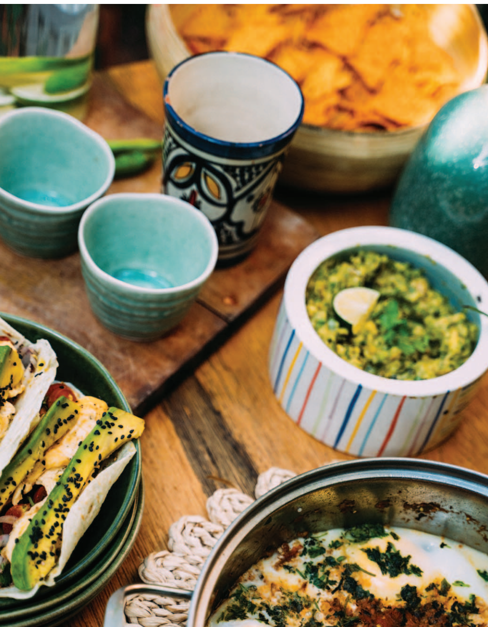
Cinco de Mayo Side Dishes pg. 5