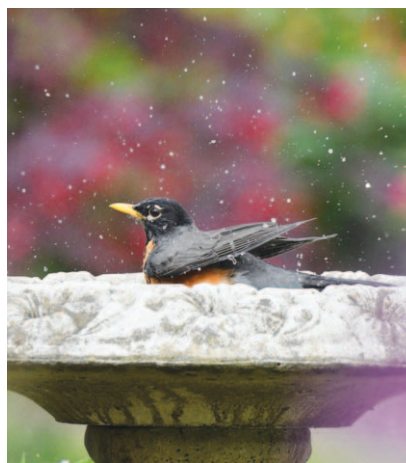
Create a Bird-Friendly Yard pg. 6