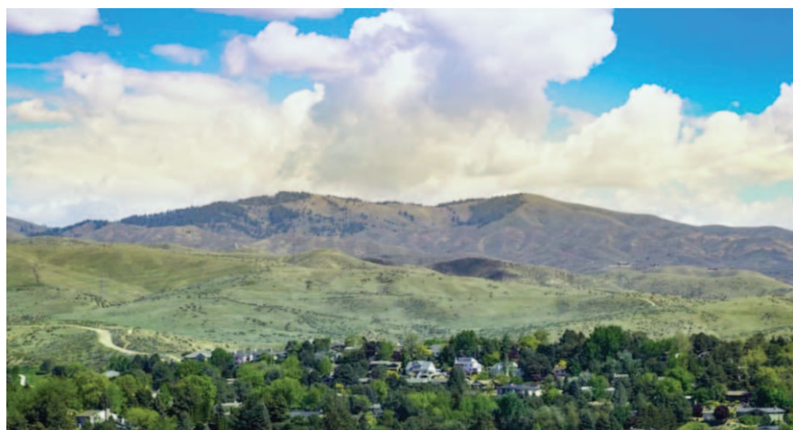
Boise's Best Adventures pg. 10