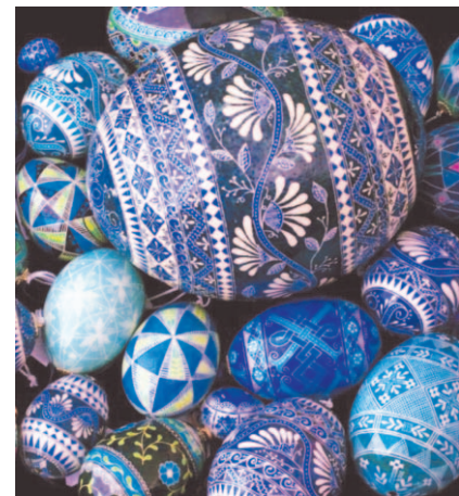
Pysanky – Ukrainian Eggs pg. 4